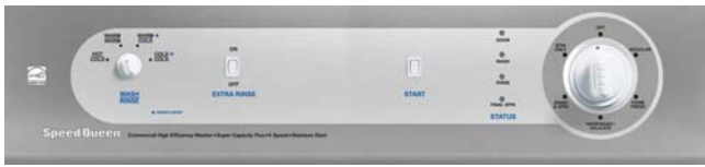
CTSA0A (Shown on front) - 8 Cycles, ADA Compliant, ENERGY STAR® Qualified, Front Control