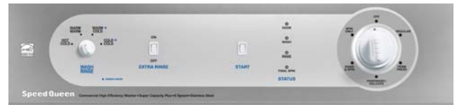
ATSA0A - 8 Cycles, ADA Compliant, ENERGY STAR® Qualified, Rear Control