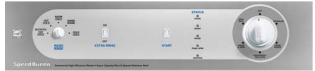
ATSA5A - 8 Cycles, ADA Compliant, ENERGY STAR® Qualified, Rear Control, Boosted Heat