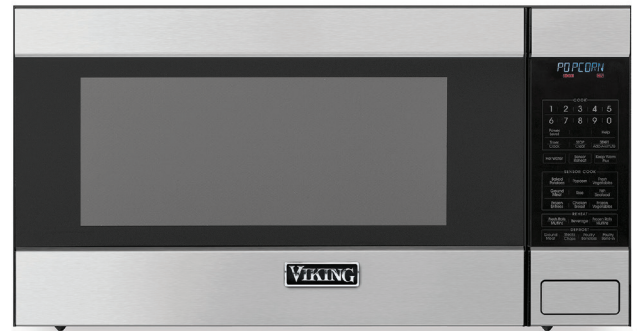
30" Wide Conventional Microwave Oven