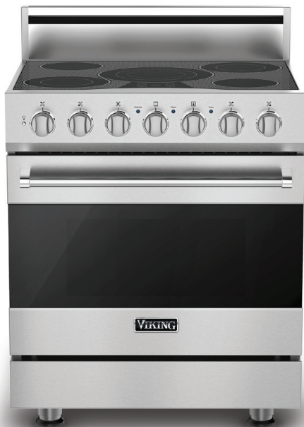
30" Wide Electric Range (Shown with optional 6" H. backguard)