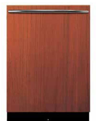
24" Wide Dishwasher (Shown with custom panel)