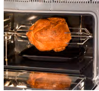
Integrated Motorized Rotisserie System