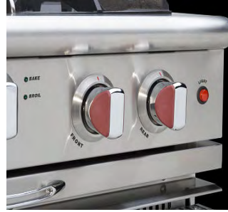
Optional Cabernet red knobs