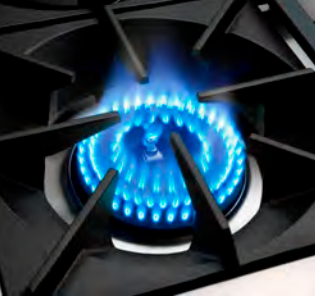
Power-Flo Open Burner 25,000 BTU