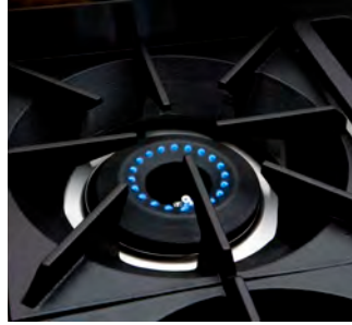
8,000 BTU Small Pan Burner