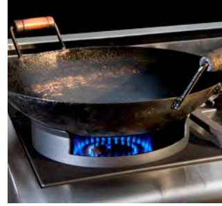
Capital exclusive feature: Flex-Roll oven racks