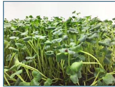
Daikon Radish Sprouts—5 days old

Grow herbs and micro greens 365 days a year. You control the freshly harvested supply of greens for your culinary creations. And they're at their freshest, peak flavor!