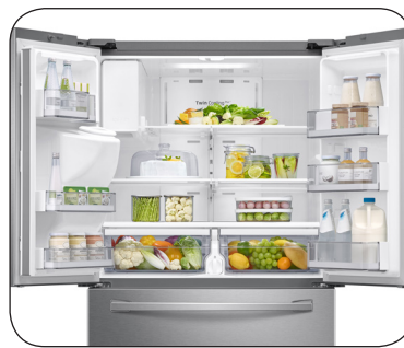
French Door Design