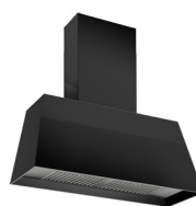
KMC30NE Matt black canopy