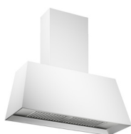
KMC30BI Matt white canopy