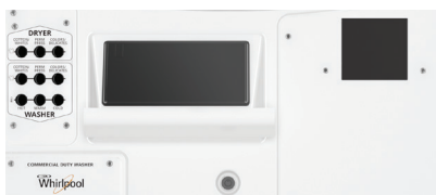
CET9100GQ / CGT9100GQ