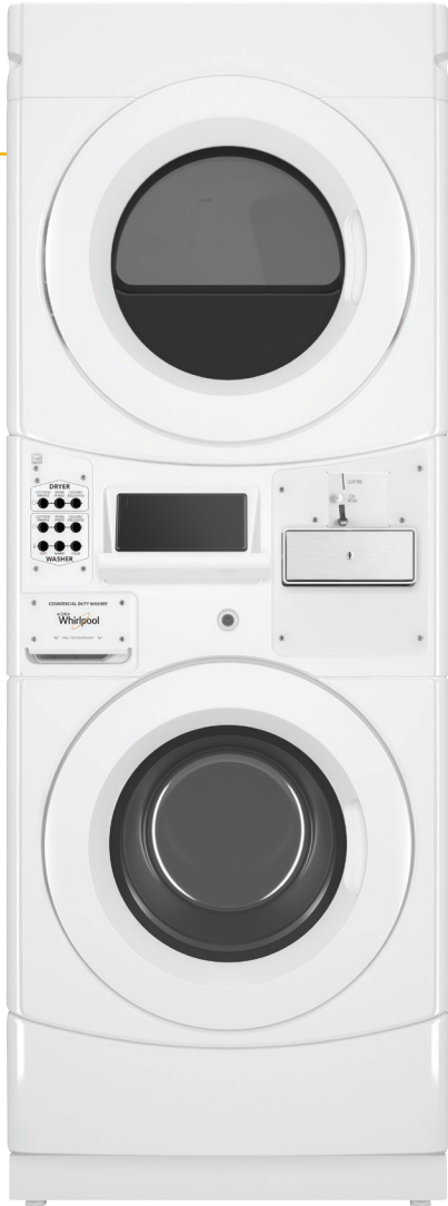
CET9000GQ / CGT9000GQ