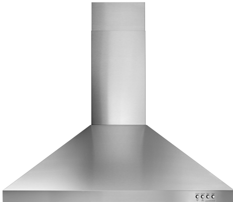
Stainless Steel WVW53UC0FS