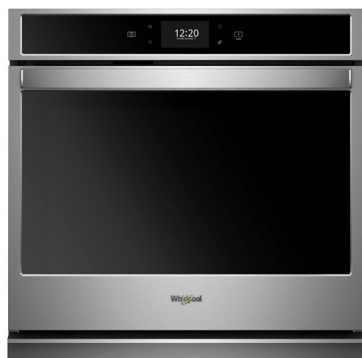
Stainless Steel WOS72EC0HS