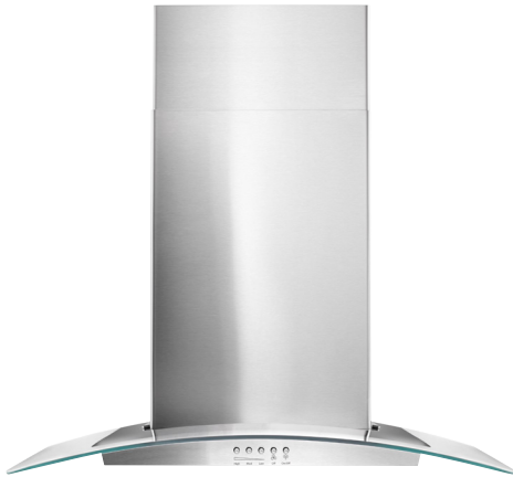
Stainless Steel WVW51UC0FS