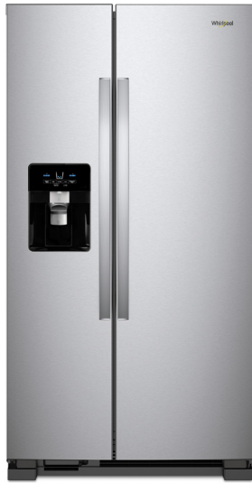
Monochromatic Stainless Steel WRS331SDHM