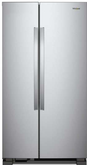
Monochromatic Stainless Steel WRS315SNHM