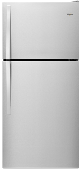
Monochromatic Stainless Steel WRT318FZDM