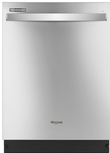
Fingerprint-Resistant Stainless Finish WDT710PAHZ