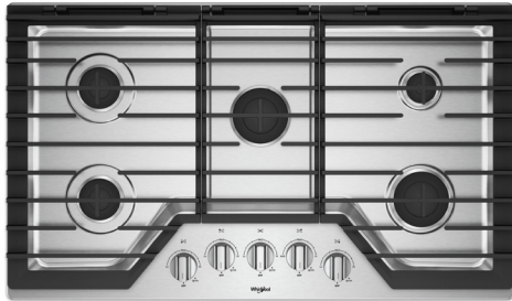
Stainless Steel WCG55US6HS