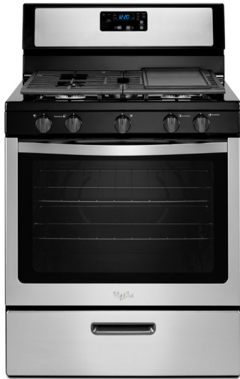
Stainless Steel WFG505M0BS