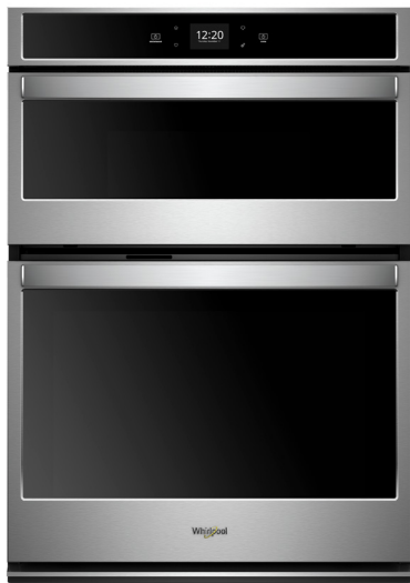
Stainless Steel WOC54EC7HS