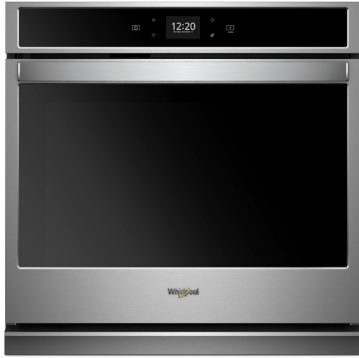
Stainless Steel WOS51EC7HS