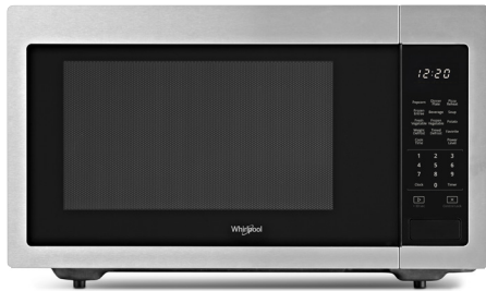
Fingerprint Resistant Stainless Steel WMC30516HZ